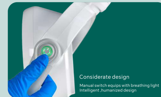
Considerate design Manual switch equips with breathing light Intelligent ,humanized design