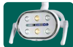
Yellow and white mixed light

High power and high color rendering LED are more concentrate to the oral cavity they are no uncomfortable light to the patient's eyes.