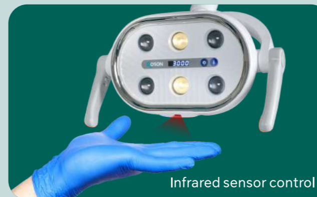
Infrared sensor control